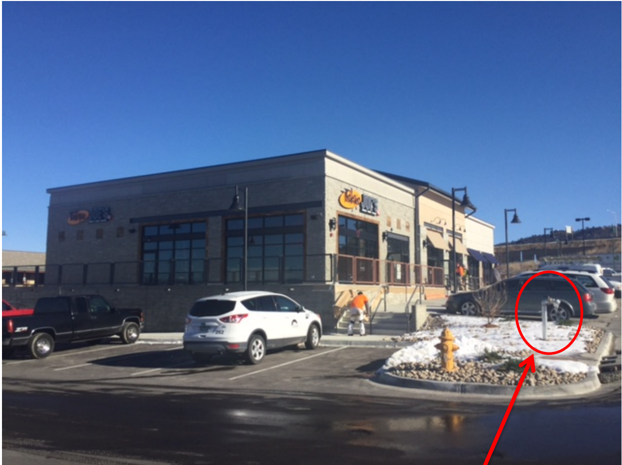
Completed FDC located near a hydrant, away from the building accessible to the fire department